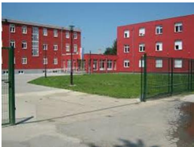
Students home in Borovo Naselje

Borovo Naselje is a Vukovar borough located on the right bank of the Danube river in the Croatian region of Slavonia , 4 kilometers northwest of Vukovar town centre; Borovo Naselje sprung up around the Borovo rubber products factory, built and owned by Tomáš Baťa before World War II. The entire town was built around the factory to provide housing and other necessary institutions for the employees.. After Borovo Naselje merged with Vukovar, it shed its name and became a part of Vukovar, but it's still known as Borovo Naselje among the locals.